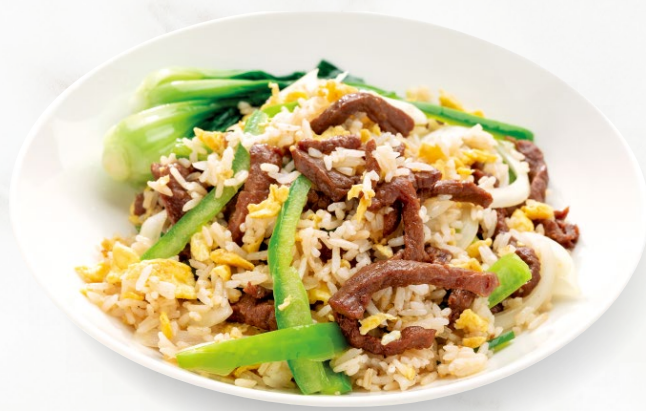
Beef Fried Rice 青椒牛肉炒飯