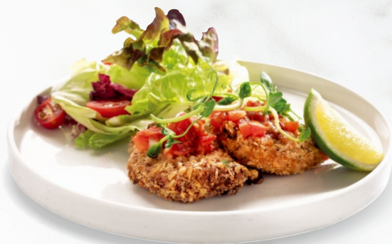
Southern Fried Pork 南方炸豬排