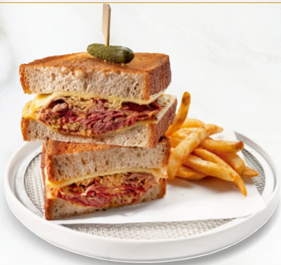
Reuben Sandwich 魯賓三明治