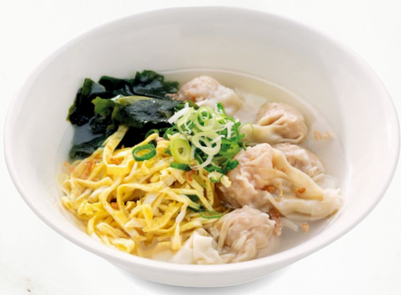
Wonton Soup 餛飩湯