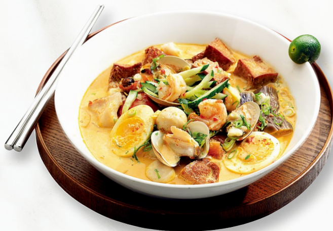
ACC Laksa Noodles 美僑咖哩米粉湯

Boneless Chicken, Vegetables, Fragrant Rice, Chicken Broth. Served with Chili Sauce, Dark Soya Sauce, Ginger Garlic Sauce, and Seasonal Vegetables