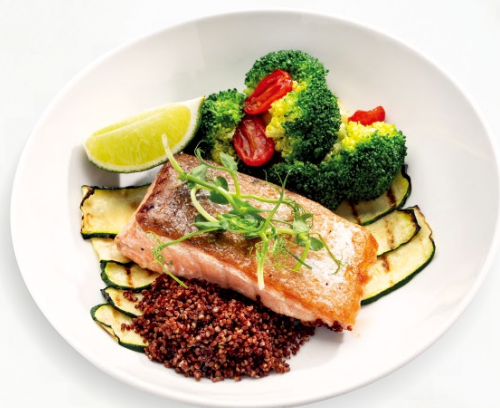
Atlantic Salmon Fillet 大西洋鮭魚排

Grilled Salmon, Broccoli, Zucchini, Sun-Dried Tomatoes, Quinoa, Raspberry Vinaigrette