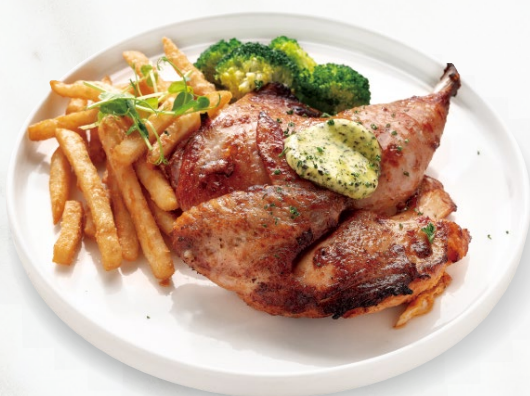
Roasted Half Chicken 香料烤半雞