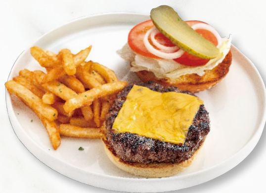
Classic ACC Burger 招牌漢堡

6 oz Ground Chicken Patty or 8 oz Beef Patty (NZ), Pineapple, BBQ Sauce, Cheese, Lettuce, Onions, Tomatoes, Gherkin, Honey Mustard Mayonnaise