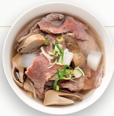
Sliced Beef Soup with Braised Minced Pork Noodles 牛肉湯附滷肉麵