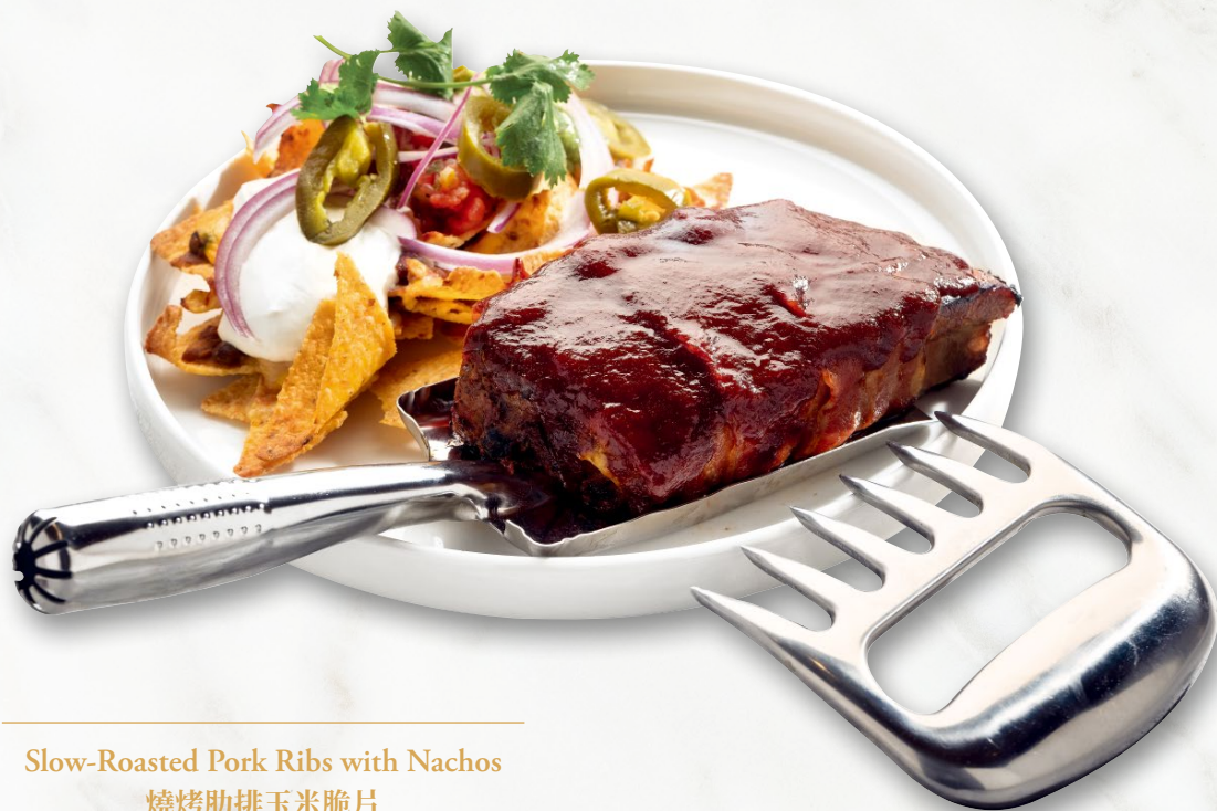
Slow-Roasted Pork Ribs with Nachos 燒烤肋排玉米脆片

Grilled Salmon, Broccoli, Zucchini, Sun-Dried Tomatoes, Quinoa, Raspberry Vinaigrette