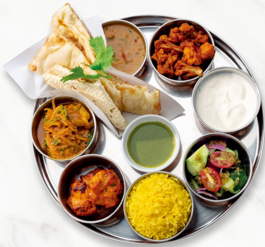
Thali Set 塔理印度咖哩套餐