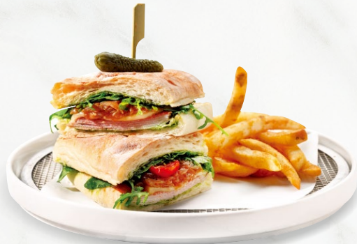
“Italian Style” Sandwich 義式乳酪三明治