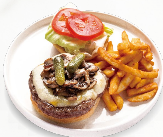
A5 Wagyu Double Cheeseburger A5 和牛起司漢堡

6 oz A5 Wagyu Ground Beef, Sautéed Mushrooms with Grated Truffle, Smoked Provolone Cheese, Cheddar Cheese, Truffle Dijon Mustard, Lettuce and Tomatoes