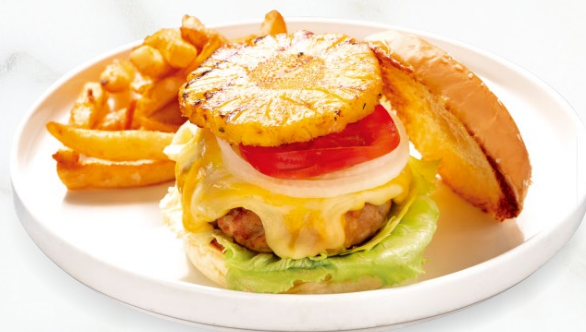
Grilled Pineapple Chicken Burger 碳烤鳳梨雞肉漢堡