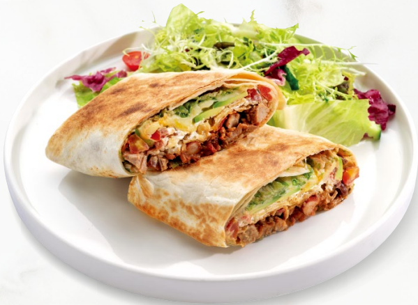
BBQ Pork Wrap 豬肉捲餅