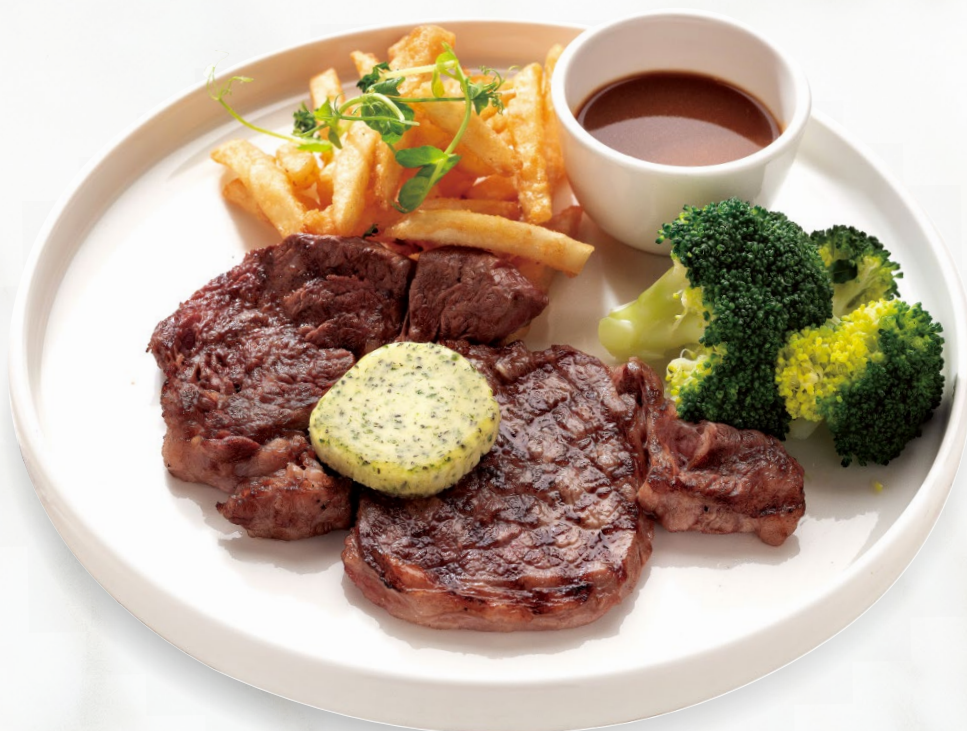
Grilled US Beef Steak with Herbed Butter 香料烤肋眼牛