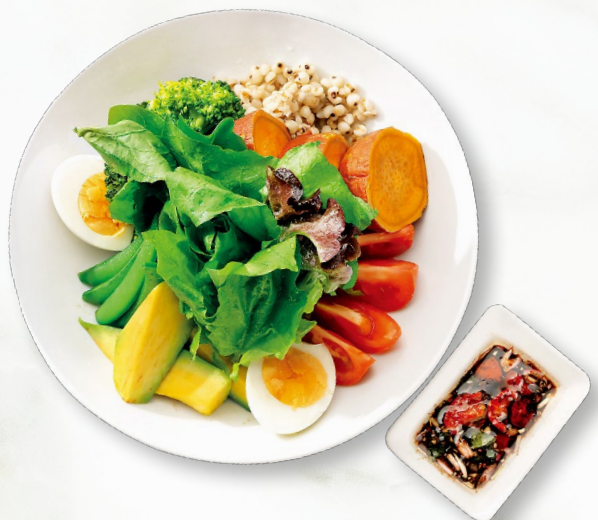
Healthy Salad 健康沙拉