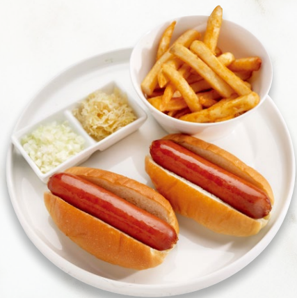
Smoked Hot Dog 煙燻熱狗

Salami, Ham (CA/NL), Arugula, Mozzarella Cheese, Bell Peppers, Sun-Dried Tomatoes, Onions, and Pesto in Ciabatta Bread