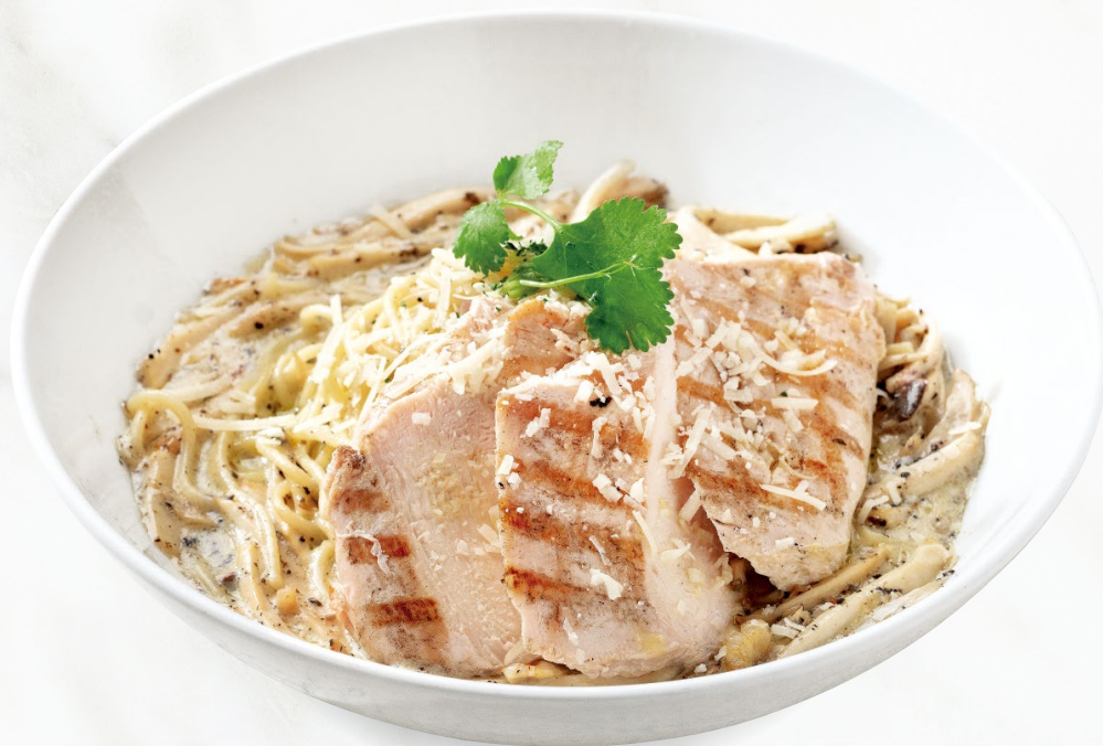
Creamy Truffle Chicken Pasta 松露奶油雞肉麵