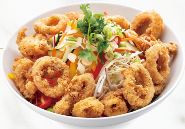
Asian Calamari Salad 亞洲炸花枝沙拉