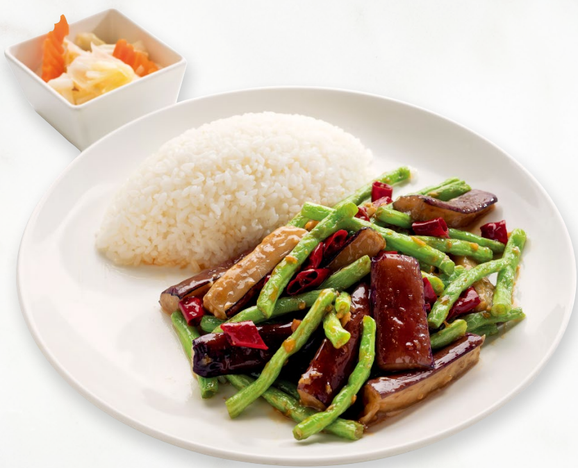
Wok-Fried Eggplant, Green Beans with Soy Chili Sauce 豆角燒茄子