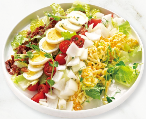
Cobb Salad 科布沙拉