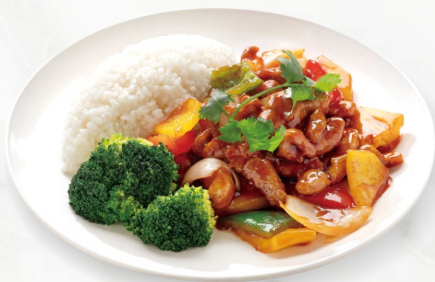
Chinese Style "Sweet and Sour" 糖醋系列