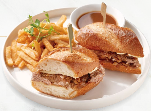
French Dip 烤牛肉三明治