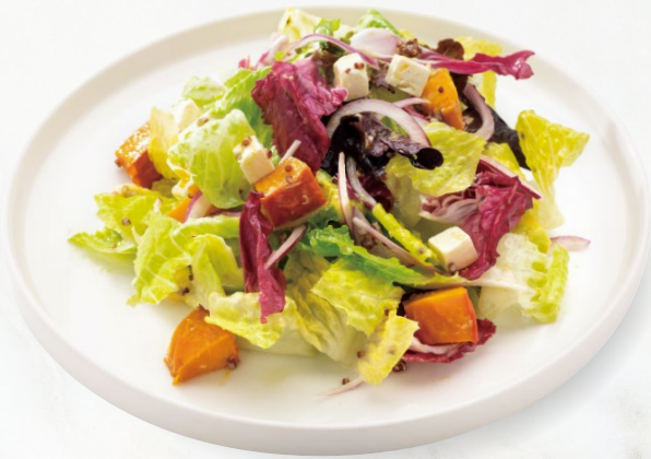
Pumpkin with Avocado Salad 酪梨南瓜沙拉