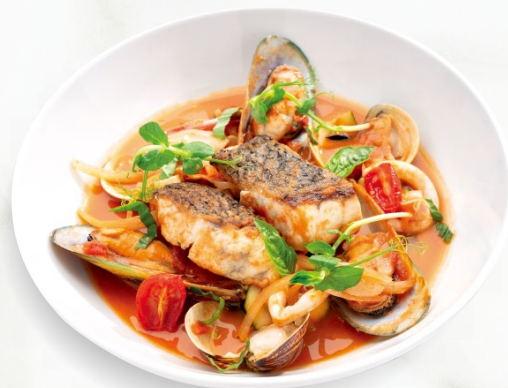
Acqua Pazza 義式水煮魚

Fish, Clams, Calamari, Mussels, Zucchini, White Wine, Onions, Garlic, Tomatoes, Basil